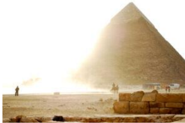
Great Pyramid of Khufu.

The Great Pyramid of Khufu has been an object of fascination since the very beginning of archaeology, yet even today it continues to reveal fascinating new discoveries. After a lengthy program to use non-destructive methods to map the Great Pyramid, the Egyptian Ministry of Tourism and Antiquities announced the discovery of a sealed chamber within the 4,500-year-old pyramid.