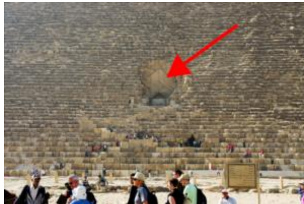
Entrance to the Great Pyramid of Khufu with the area of the hidden corridor marked with an arrow.

The archaeological and scientific teams are not yet certain of the corridor's purpose, although they hypothesize it may have been used to distribute weight and relieve pressure around other rooms inside the pyramid. According to Zahi Hawass, Egyptologist and former Minister of State for Antiquities Affairs, it is possible that this discovery will lead to further, yet unknown chambers within the pyramid, possibly even Khufu's burial chamber.