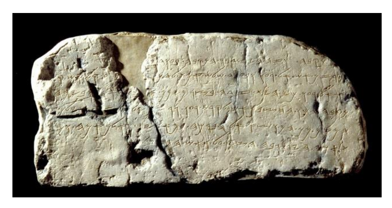
The Siloam Inscription dating from the eighth century B.C. found in Hezekiah's Tunnel describes in early Hebrew script the drama of digging the tunnel.

Bible, connecting with the roots of their heritage and identity," Orenstein noted.