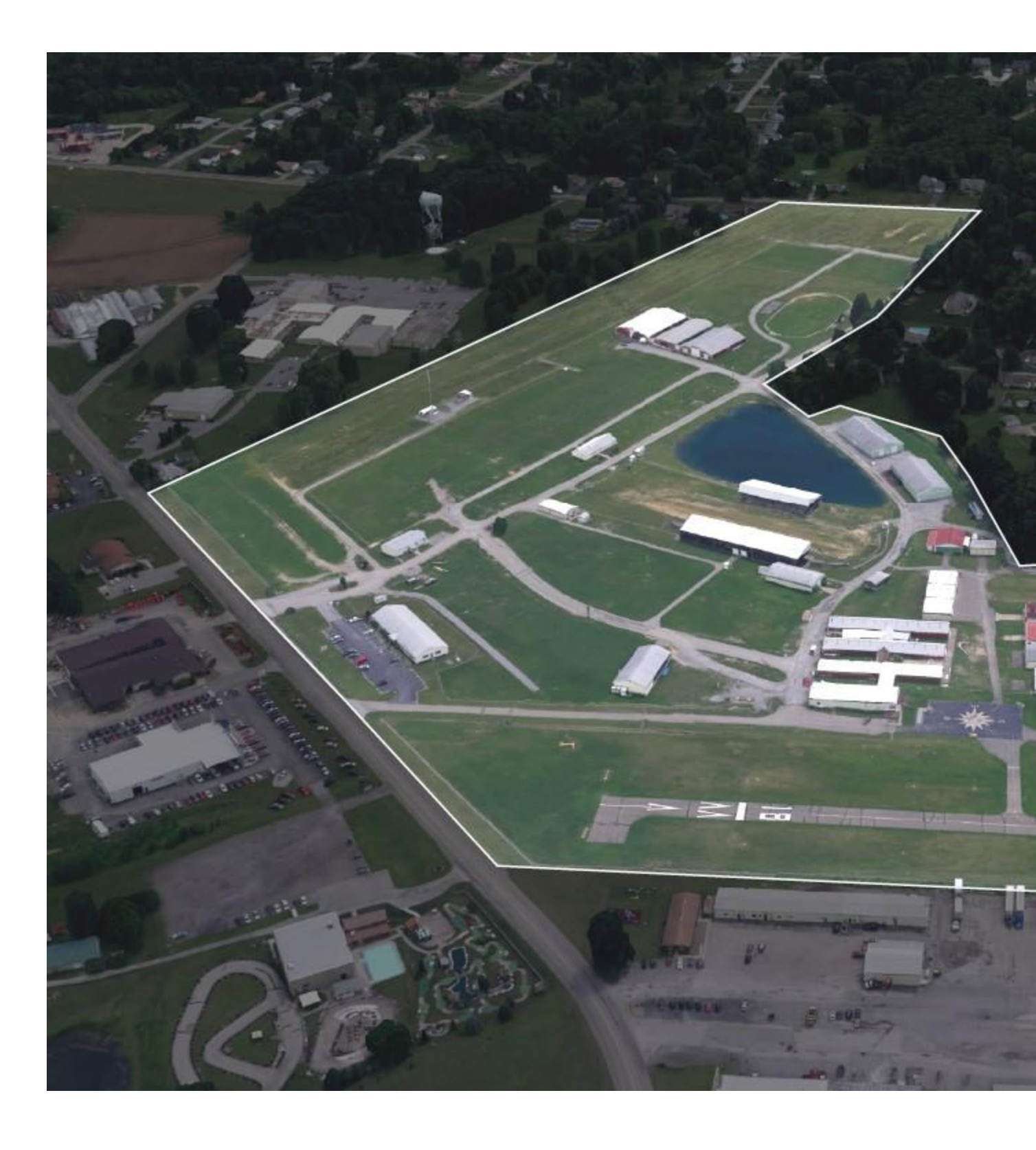
1 p.m.: The Butler Farm Show, site of the rally, opens its doors to attendees. Trump is scheduled to speak at 5 p.m.